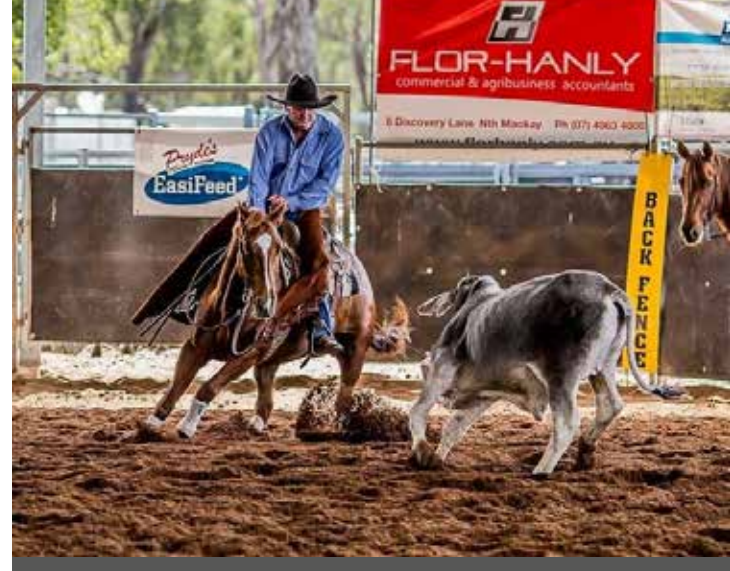
Flor-Hanly were proud sponsors of the 2015 Nebo Cutting Show

An advantage of this change is that the FMD offset account will effectively work like a mortgage offset account for a home loan. For example, if you have a $1,000,000 primary production business loan and you hold $800,000 in FMDs you will only pay interest on the remaining $200,000. Ultimately it will be up to the banks to determine how the offset accounts are actually set up and operated.